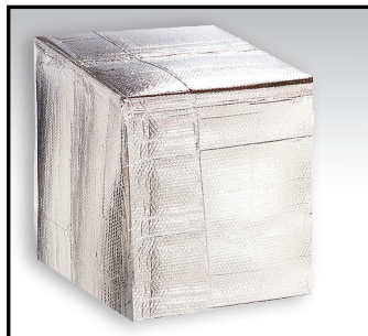
thermal pallet covers